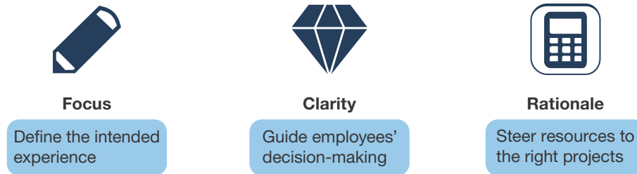
FIGURE 2 Sound CX Strategies Bring Focus, Clarity, And Rationale To CX Efforts