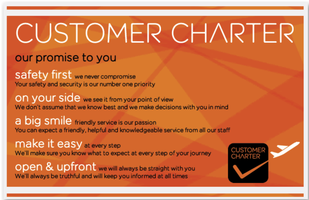
FIGURE 6 EasyJet Summed Up Its Experience Vision In Its Customer Charter