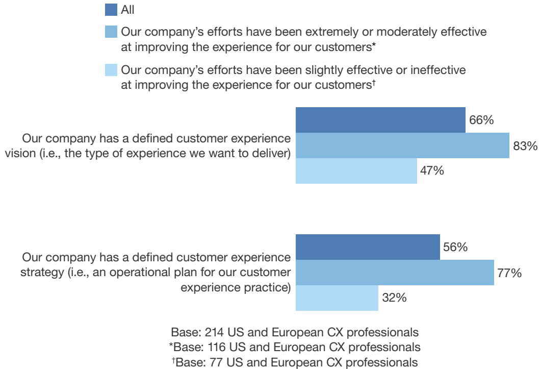
FIGURE 1 Most Firms With Ineffective CX Efforts Lack A Customer Experience Vision Or Strategy