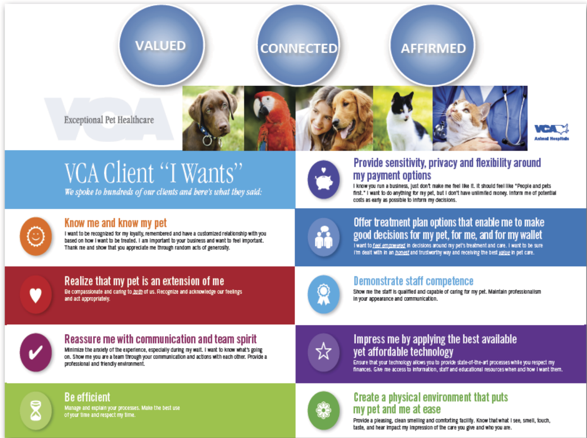
FIGURE 5 VCA Animal Hospitals Translated Its Intended Experience Into Nine Customer “I Wants”